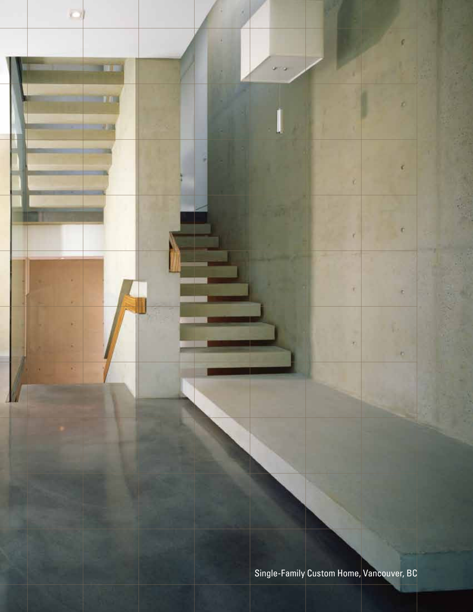
Single-Family Custom Home, Vancouver, BC