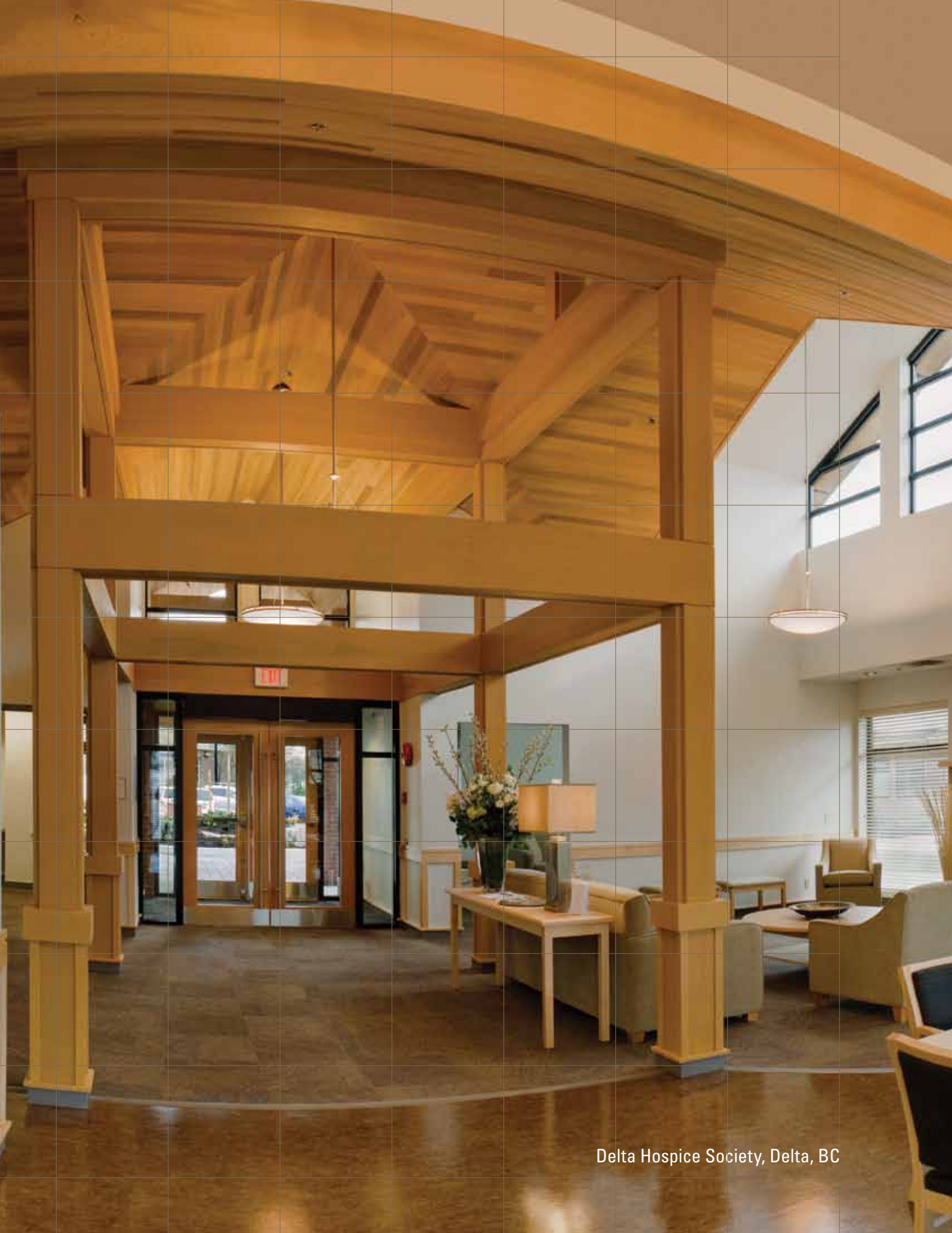
Delta Hospice Society, Delta, BC