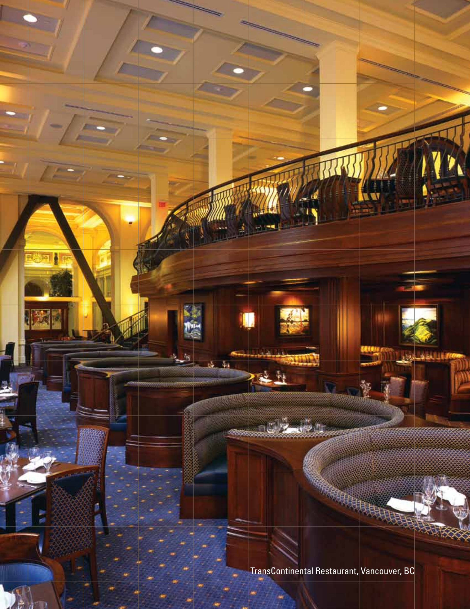
TransContinental Restaurant, Vancouver, BC