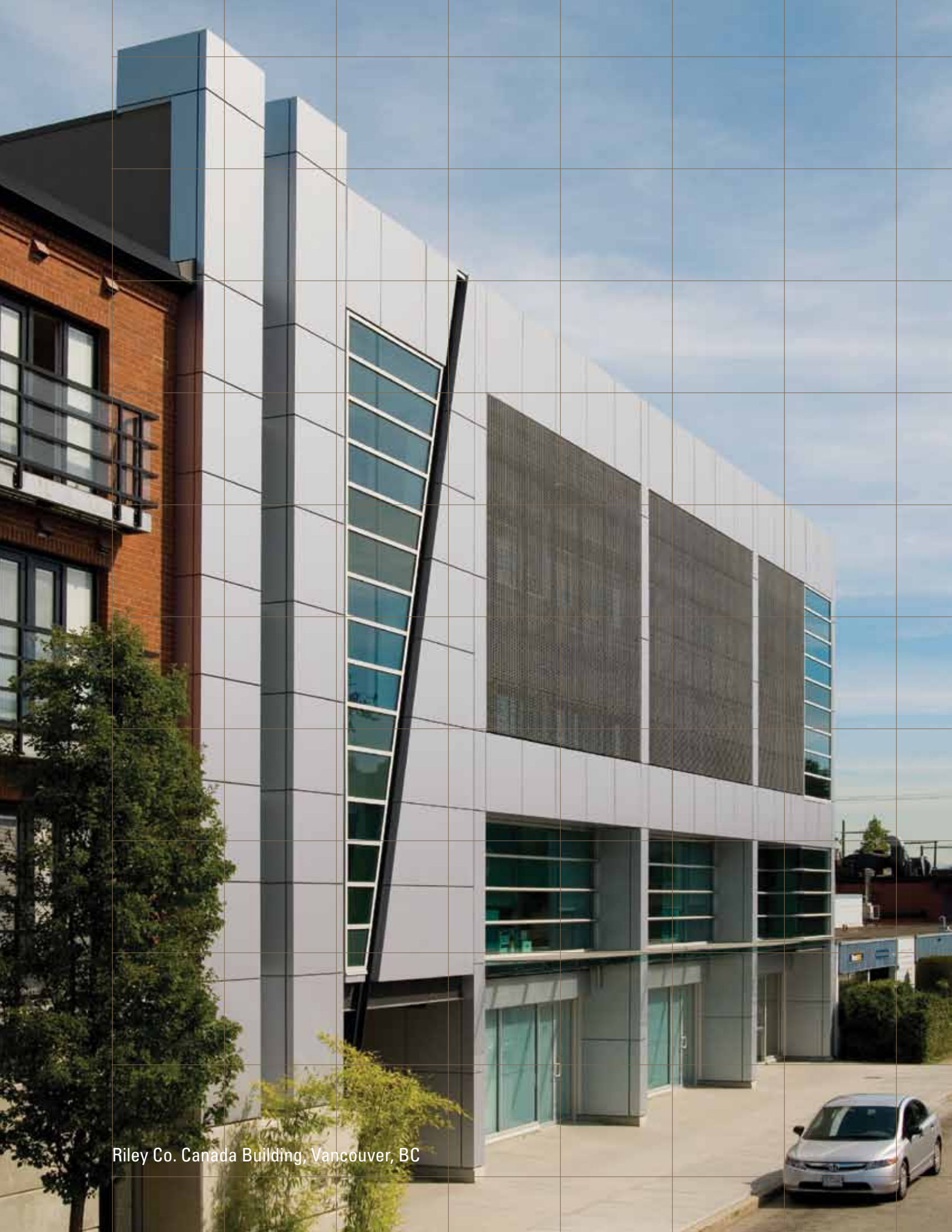
Riley Co. Canada Building, Vancouver, BC